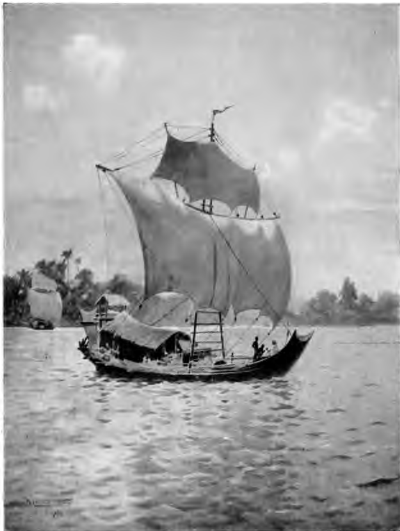
A NATIVE BOAT SAILING UPSTREAM WITH THE WIND. Page 26.